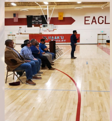
Haak'u Community Academy