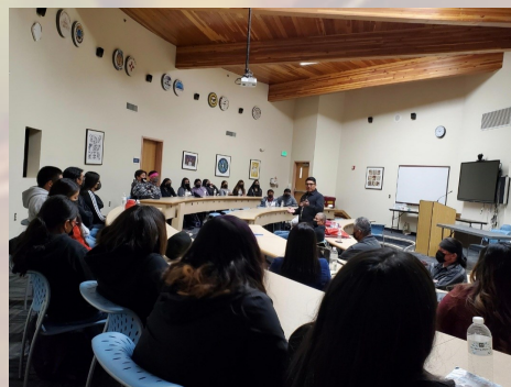
Santa Fe Indian School