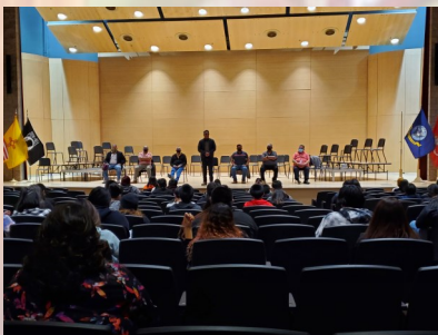
Grants High School