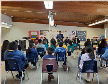
Mesa View Elementary