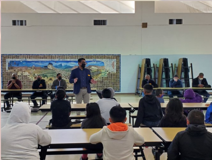
MT. Taylor Elementary